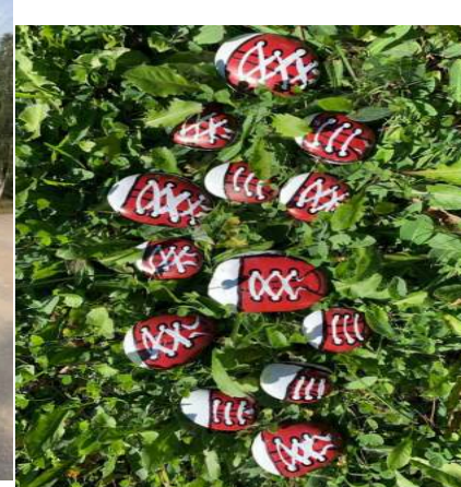
FASD rock art prepared by community partners as part of the Red Shoes Rock awareness campaign.