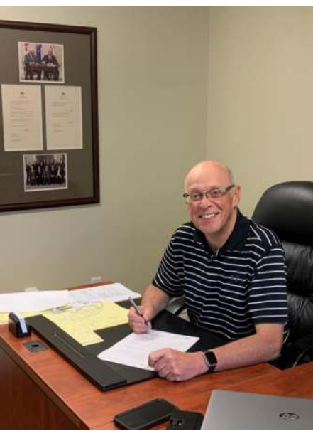
Minister Haggie signing the provincial proclamation of FASD Awareness Week.