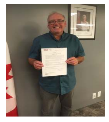
Mayor Synard - Marystown