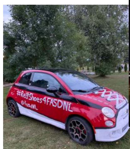
The little red sneaker car was a popular addition to FASD week!